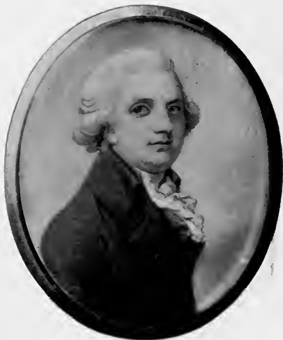
Honorable John Drayton By Richard Cosway Page 234